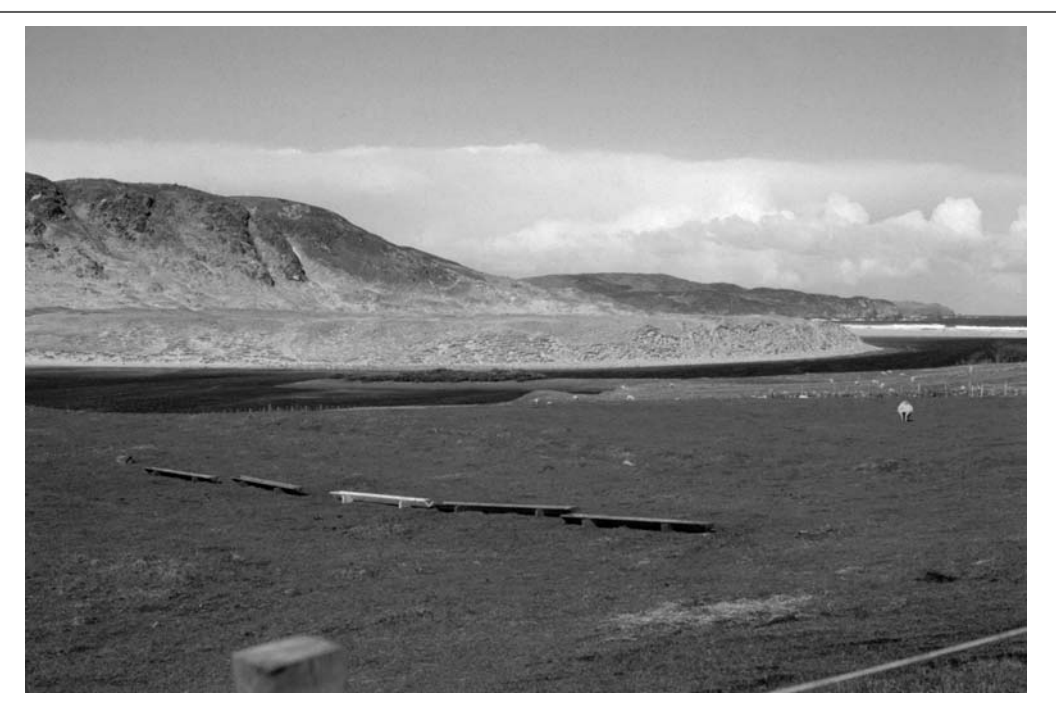
Figure 7.26: The large glaciofluvial terrace at Invernaver viewed from the east is flanked and capped by blown-sand deposits that also climb the ridge behind. The surface of the terrace also supports a wealth of archaeological remains including hut circles and cist burials.

The wide and flat sandy beach of Torrisdale Bay extends over 1 km in length from the mouth of the River Naver in the east to the mouth of the River Borgie in the west. Extensive areas of intertidal sands characterize both bays and several areas of saltmarsh have developed in the inner reaches (Figure 7.27). At low tide the beach at Torrisdale Bay can be as wide as 950 m, with about 40% of the total beach area lying above high-water mark. The sand has a median diameter of 0.2–0.3 mm and has only 3–4% shell-derived calcium carbonate. Prominent sandbars extend seawards across the mouths of both rivers. On the bar at the mouth of the River Naver, an area of low (3–4 m high) marram-clad sand dunes has experienced vigorous growth since the 1970s (Bentley, 1996b). Landwards and south of the beach at Torrisdale Bay an extensive dune system has developed, the detailed morphology of which is controlled by the eroded form of the bedrock ridge and the flat-topped glaciofluvial terraces that flank it. The Naver terrace contains a wealth of important archaeological artefacts including cairns, hut circles and cist burials. In contrast, the Borgie terrace has no known archaeological interest and is capped by an extensive (0.5 \times 0.5 \text{ km}) flat dune grassland surface used for grazing.