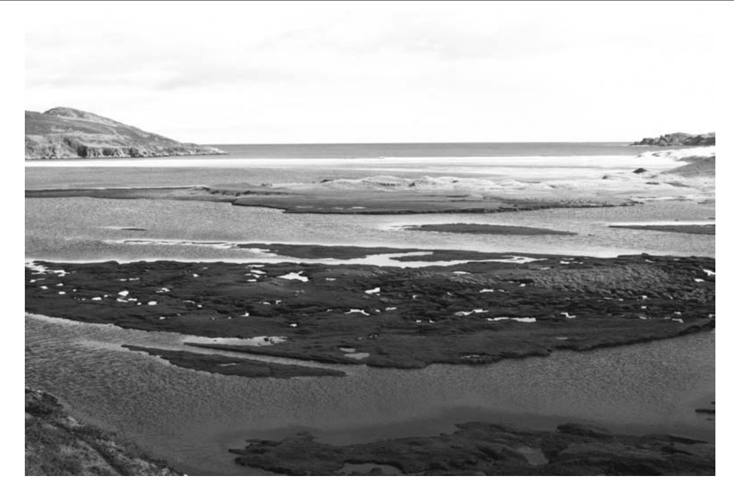
Figure 7.27: The intertidal saltmarsh and sandflats of the River Borgie exit looking northwest over the low dune area and beach of Torrisdale Bay in the middle distance.

At the rear of the beach, the coastal edge is characterized by a frontal apron of young vigorous dunes that are mostly relatively stable with vigorous marram Ammophila arenaria growth although there is some localized evidence of erosion where the vegetation cover has been stripped. The main dune ridge extends along the back of the beach and drapes the seaward edge of the Naver terrace before curving northwards round the flanks of the central rock ridge to continue into the Borgie estuary. In places the fringing dunes extend southwards onto the Naver terrace surface itself, while farther landwards some low isolated dune features rest on the top of the gravel terrace. An extensive area of dunes has also developed on the west side of Torrisdale Bay, in the triangular-shaped area lying between the Borgie terrace and the central rock ridge (Figure 7.25). The marram-clad dunes of this area are characterized by an irregular and hummocky surface topography and have no preferred alignment. However, the dune slacks occur at a common low altitude and contain standing water or damp surfaces and probably mark the position of the water table (Bentley, 1996b). Gravel is exposed at the base of some slacks (Ritchie and Mather, 1969). This dune system drapes the northern part of the Borgie terrace for up to 50 m southwards before giving way to a much smoother and vegetated dune grassland that extends over the terrace top and thins to the south.